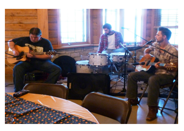
The Orange Whips perform at Octoberfest