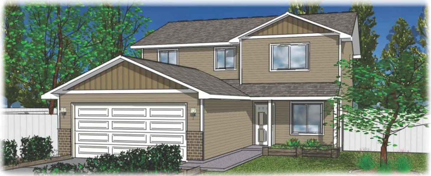
(Color combinations for brochure use only)

All measurements, dimensions and square footage are approximate and may vary. Prices may change without notice.