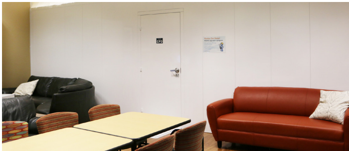
McCain Walls system with single-door access, UC San Diego Hospital.