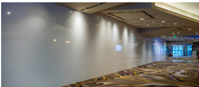
200' McCain Walls system, Aria Hotel & Casino in Las Vegas.