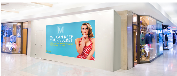
Increase brand awareness with graphics-ready walls.