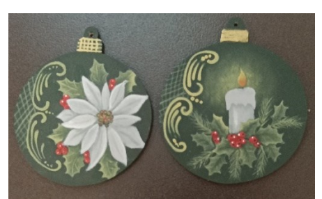
Poinsettia and Candle ornament Peggy Thomas January 2025