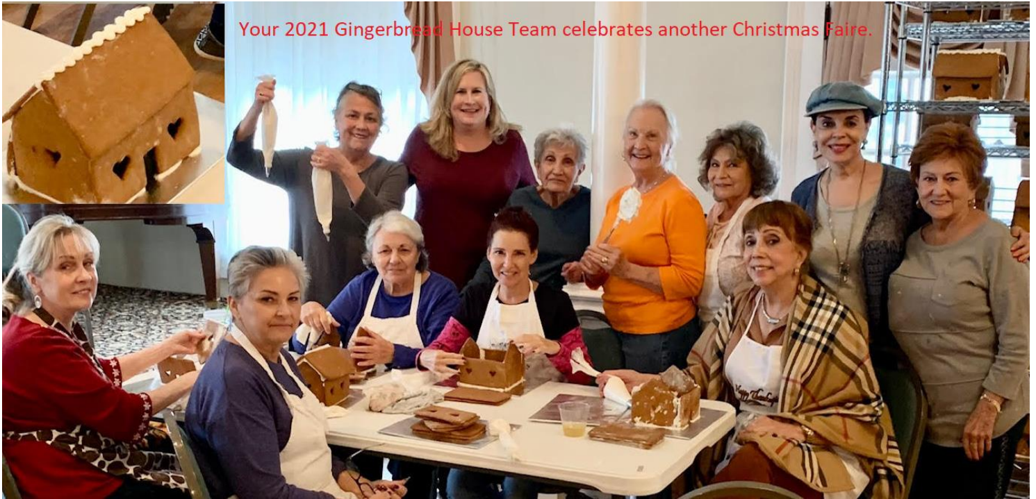
Your 2021 Gingerbread House Team celebrates another Christmas Faire.