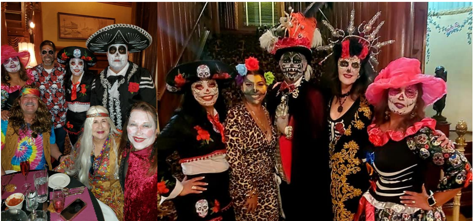
(More photos on the Woman's Club FB page)

We truly did dance until we dropped, and we look forward to next year's party and fund-raiser. The party netted $1400 for The Woman's Club.