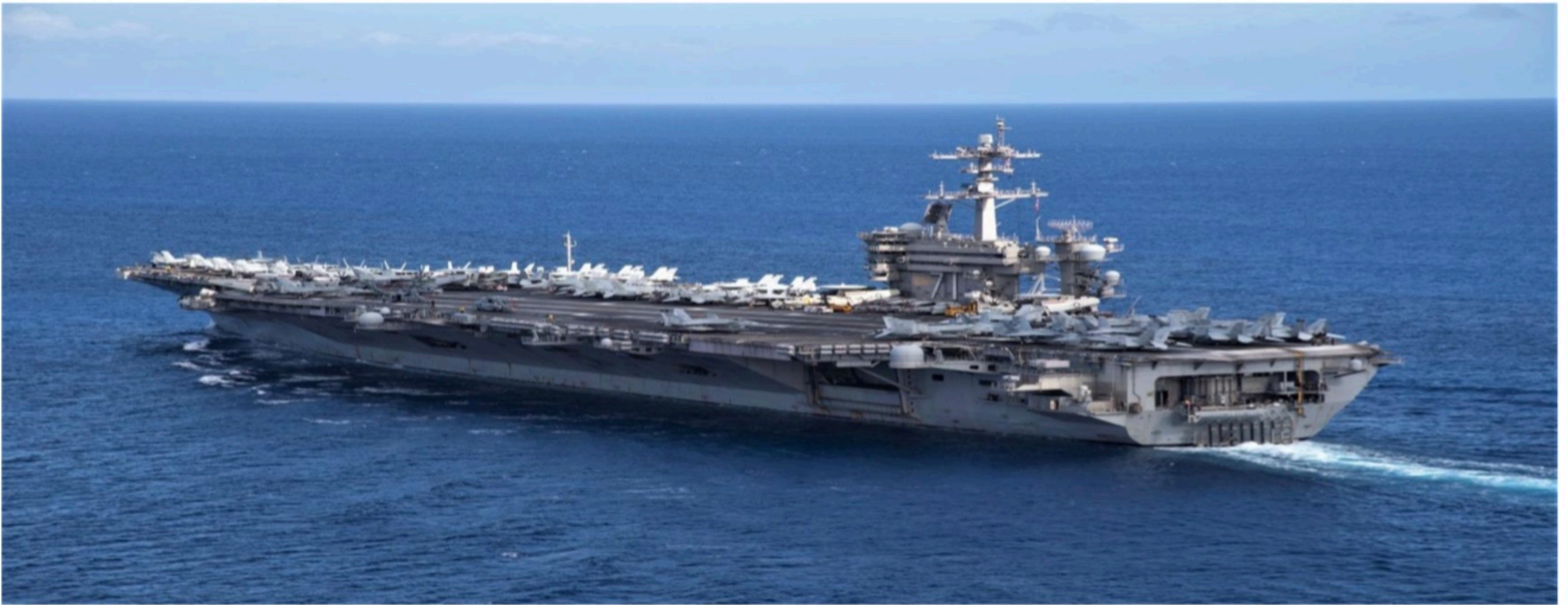
USS THEODORE ROOSEVELT

As the immediate crisis from the pandemic passes, the military will resume its normal movements, albeit with caution. For the Army and Air Force, such caution will be geared to the individual; those suspected of suffering from the coronavirus can be more easily isolated were stationed or returned home. Such precautions will never be so easy in the Navy: Most enlisted share berthing with several dozen colleagues and even officers and pilots can have two or three roommates. Those senior enough to have single staterooms still work in close quarters. Ward rooms and heads have ample supplies of hand sanitizers, but hundreds pass through each in a day. Passageways are narrow and ladders impossible to clean after each use.