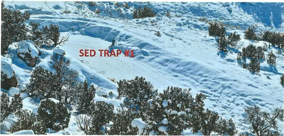
Sediment Trap #1 is empty and clean water flows from trap to pond 018 in normal open condition.