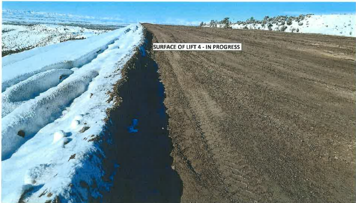
SCA#2 Ash Landfill – Current surface northwesterly Lift #4 in progress