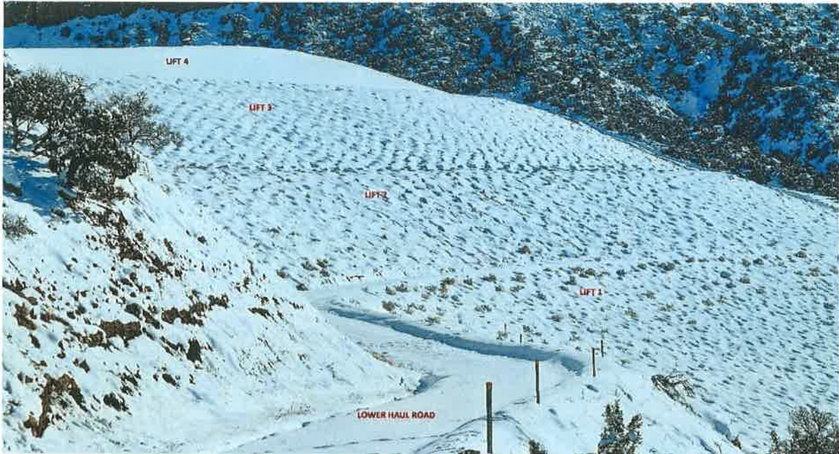
SCA#2 Ash Landfill –looking southeasterly