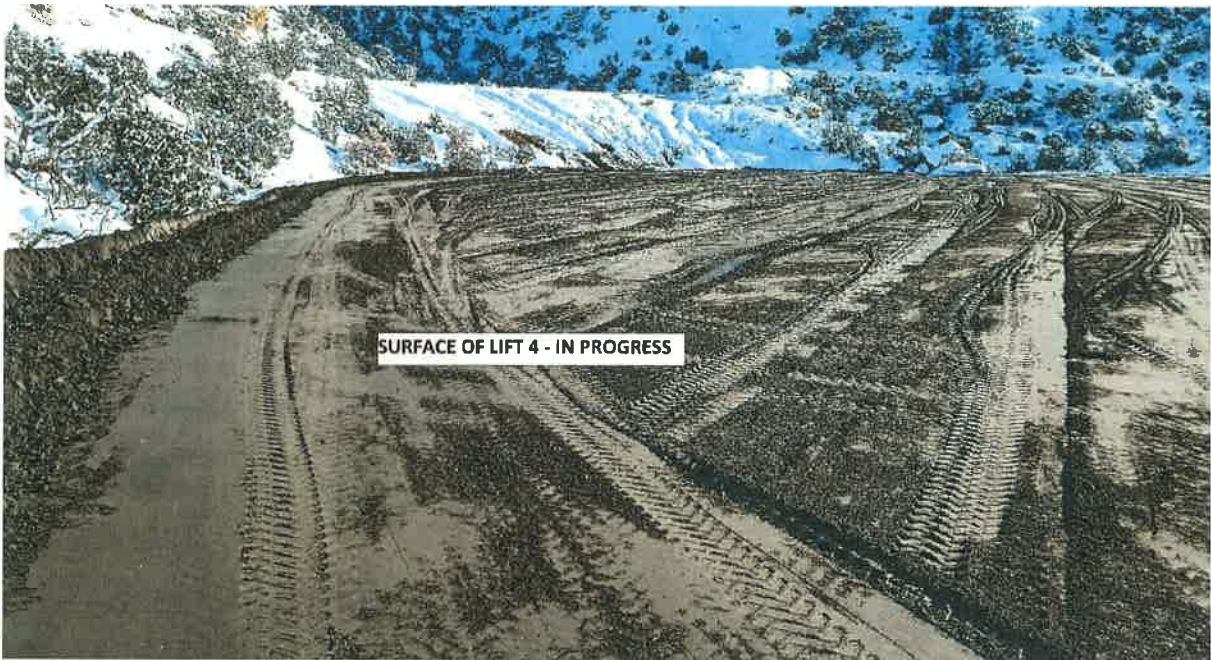
Surface of Lift #4 in process – photo looking east - southeast