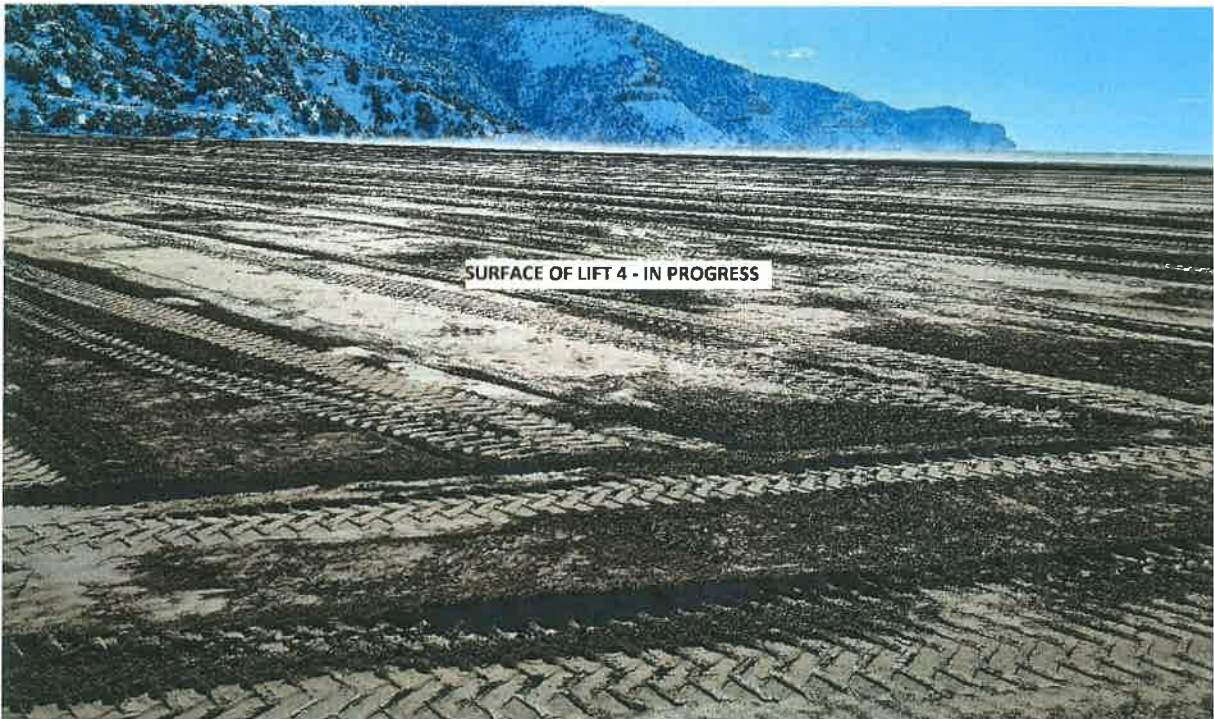
Surface of Lift #4 in progress – photo looking west - southwest Compaction appears satisfactory. Dust suppression appears satisfactory Surface slopes east towards the hill to prevent storm water run-on