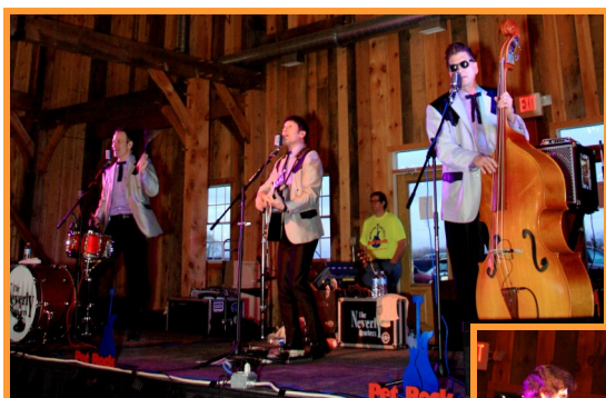
PET ROCK entertainment included (top to bottom): The Neverly Bros., The Spaniels Forever, Oscar & The Majestics and The Radio Memories Malt Shop Revue.