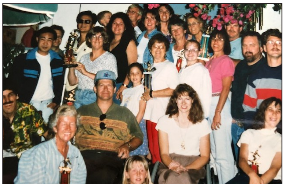
The Unrecables' Summer Awards Party in mid 1990's.