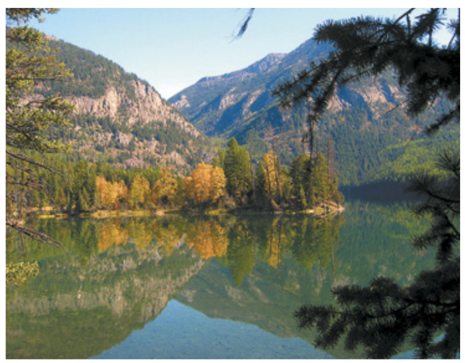
Looking over Holland Lake to the Swan Mountains

An alpine setting and a peak into the Bob Marshall Wilderness are some of the rewards this strenuous trail offers. Eight miles round trip. From mile marker 15 on Highway 83 turn east on Morrell Creek Road. Travel 1.1 miles to West Morrell Road and follow it for six miles. Turn onto Pyramid Pass Road, the trailhead is in 5.5 miles.