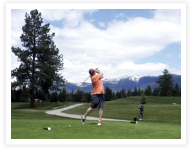
Visit www.SeeleyLakeChamber.com for more information

You'll find the course the quietest in the afternoon – and Twilight Rates make it a great value for your Seeley Lake visit. Stick around for the snow, and you can cross-country ski on the trail they groom on the course.