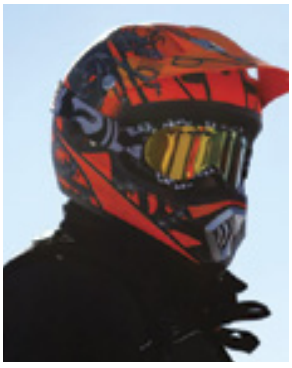
Shawn LOCAL EXPERT

"Seeley Lake has 360 miles of groomed trails for any type of rider. Picturesque scenery with, breathtaking mountain views. Seeley Lake, where you can ride right out your back door."