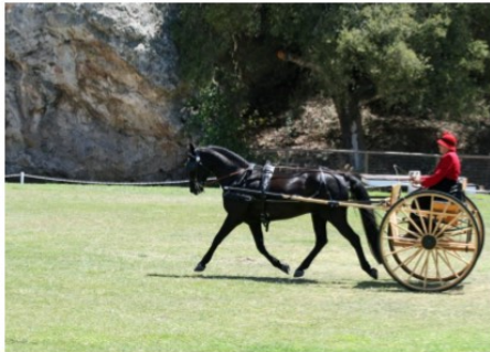
Meadowbrook with 15 hand horse