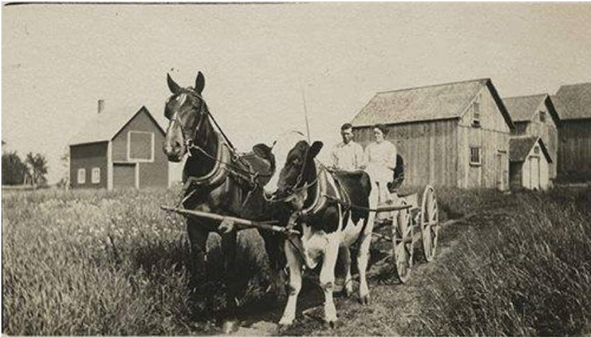
“Drive what ya got”

How many modern driving horses do you think would survive this pair?