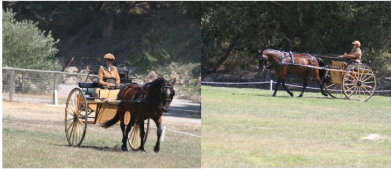
Meadowbrook with 16.2 hand horse

52 inch wheels , Shafts are 7 feet in length , shafts are 35 inches wide