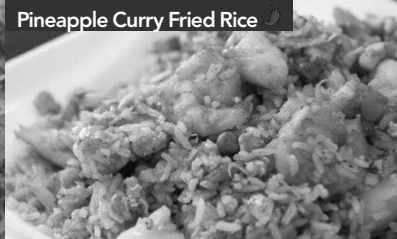
Pineapple Curry Fried Rice