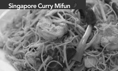
Singapore Curry Mifun