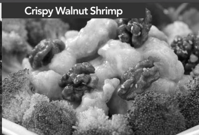
Crispy Walnut Shrimp