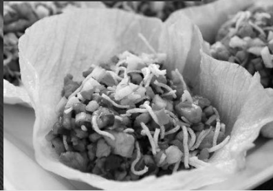
Chicken Lettuce Wrap