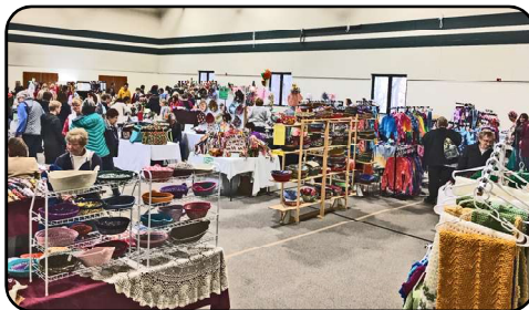
A view of some of the 75 vendors in the gym.

tography, floral, quilts, weaving, sewing, soaps, candles, paintings, framing, seasonings, clay ceramics, and