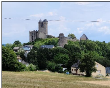
Location of the Bell Castle Museum