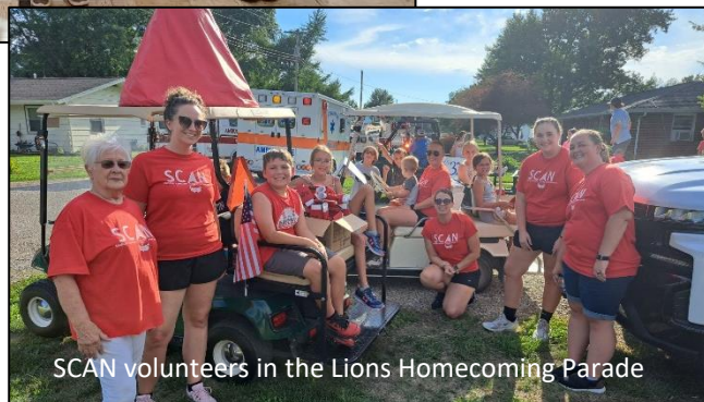
SCAN volunteers in the Lions Homecoming Parade

Seeing their confidence bloom in such a short time was wonderful! Thank you to all who helped and to the participants!