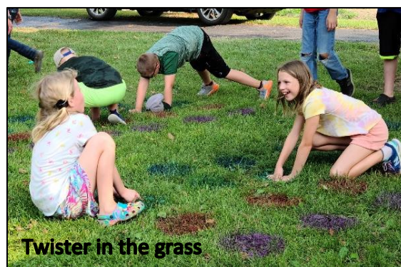
Twister in the grass

The Strasburg Lions would like to thank all who came and ran the 5K during the 2023 Homecoming. There were 49 runners for the 5K and 3 runners for the 1-mile fun run. Award photos and official times can be viewed on the Strasburg Lions Club Facebook Page.