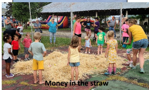
Money in the straw