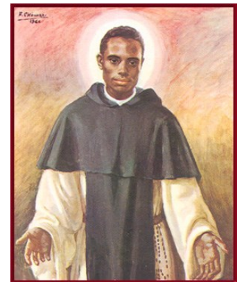
Feast Day: November 3

Sources: franciscanmedia.org and catholic.org