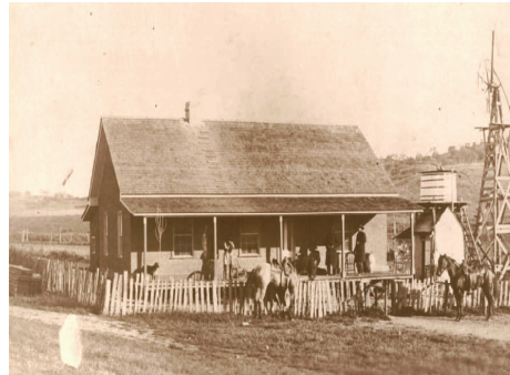
Original Chimineas Adobe, circa 1880

Some of the grateful recipients of your Life Membership gift.