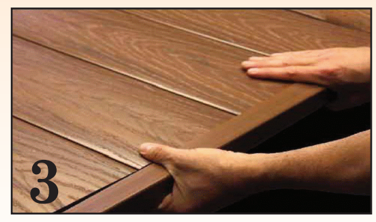
Finish with trim