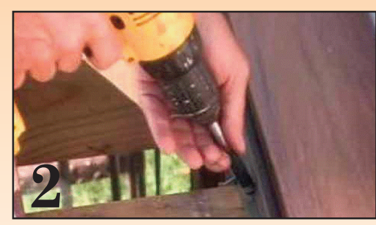
Screw to joists