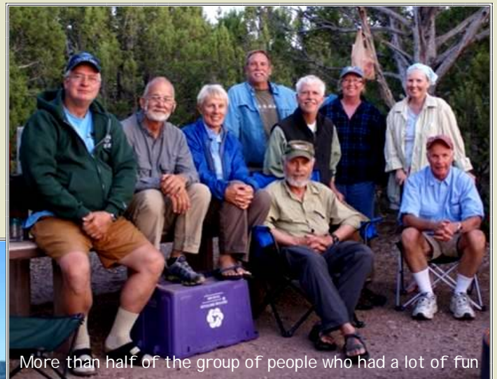
More than half of the group of people who had a lot of fun