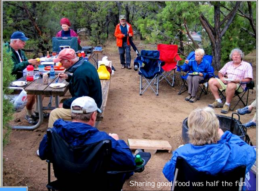
Sharing good food was half the fun