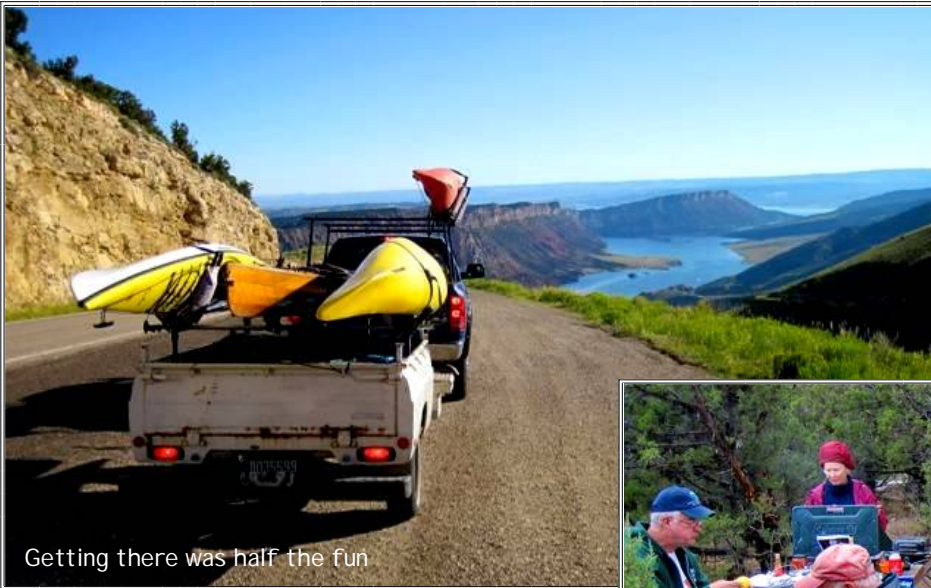
Getting there was half the fun