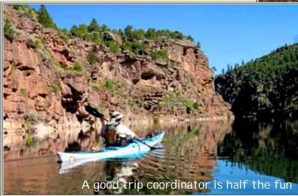
A good trip coordinator is half the fun