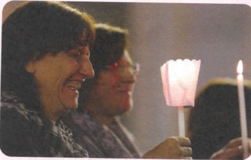
CATHOLIC NEWS AGENCY