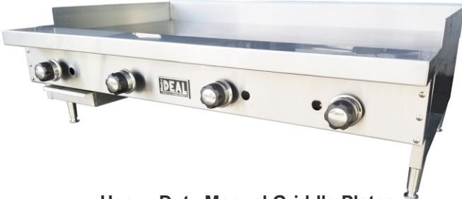
Heavy Duty Manual Griddle Plates