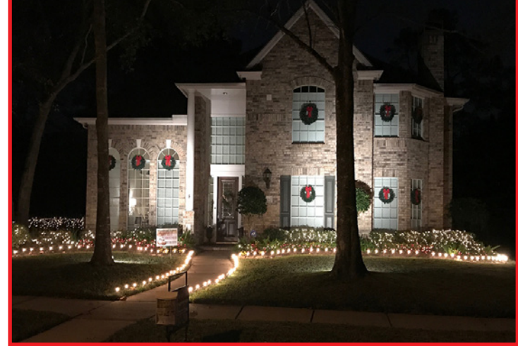
7919 Sonata Court