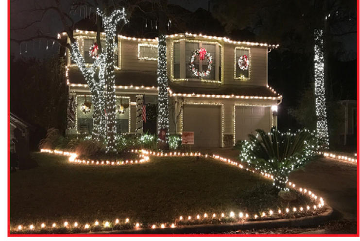
7610 Crescendo Court