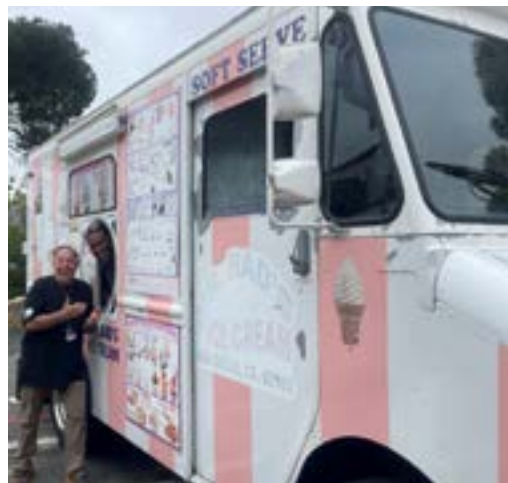
The Ice Cream Truck