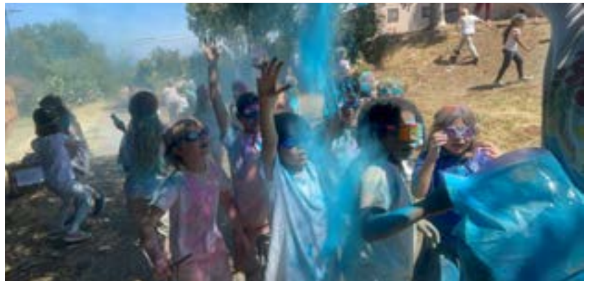
Foam Party/ Color War/ Bubble Party