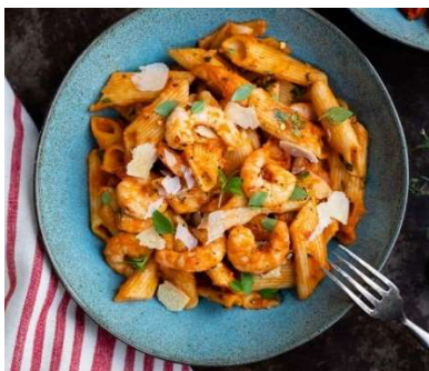
Rigatoni, Shrimp, Arrabiata