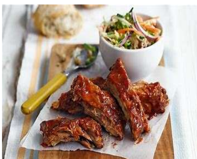
BBQ Ribs, Winter Slaw