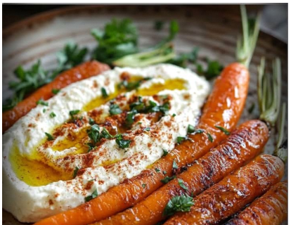
Roasted Carrots, Whipped Feta