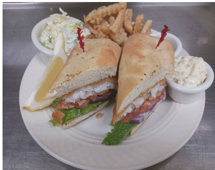
801 Fried Fish Sandwich