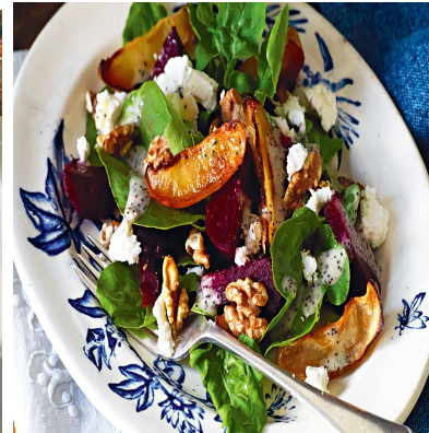
Roasted Apple & Beet Salad