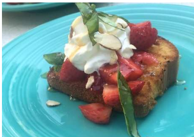
Strawberry Rhubarb Poundcake