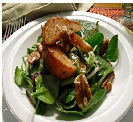
Roasted Pear & Spinach Salad