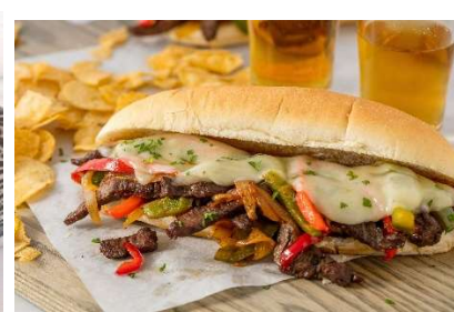
Philly Cheesesteak Panini