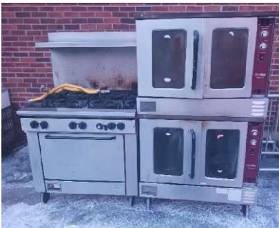
2020 – 2024 - Old Ovens

We will no longer be serving food or having special menu events in the Sunroom. The Activity room and Private Dining Room are available. Please speak with the Front Desk.