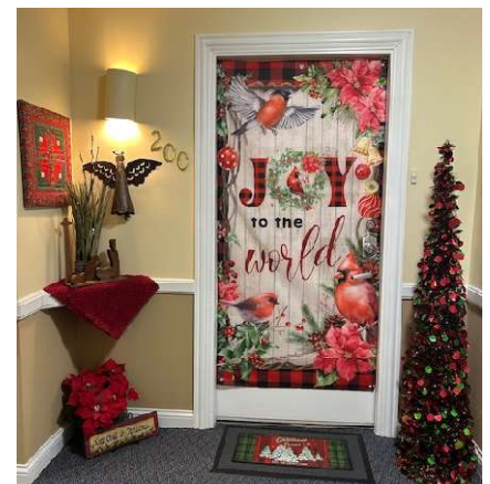
Unit #200 Door Winner! Great Job Leila!