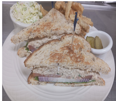
801 Tuna Salad Sandwich