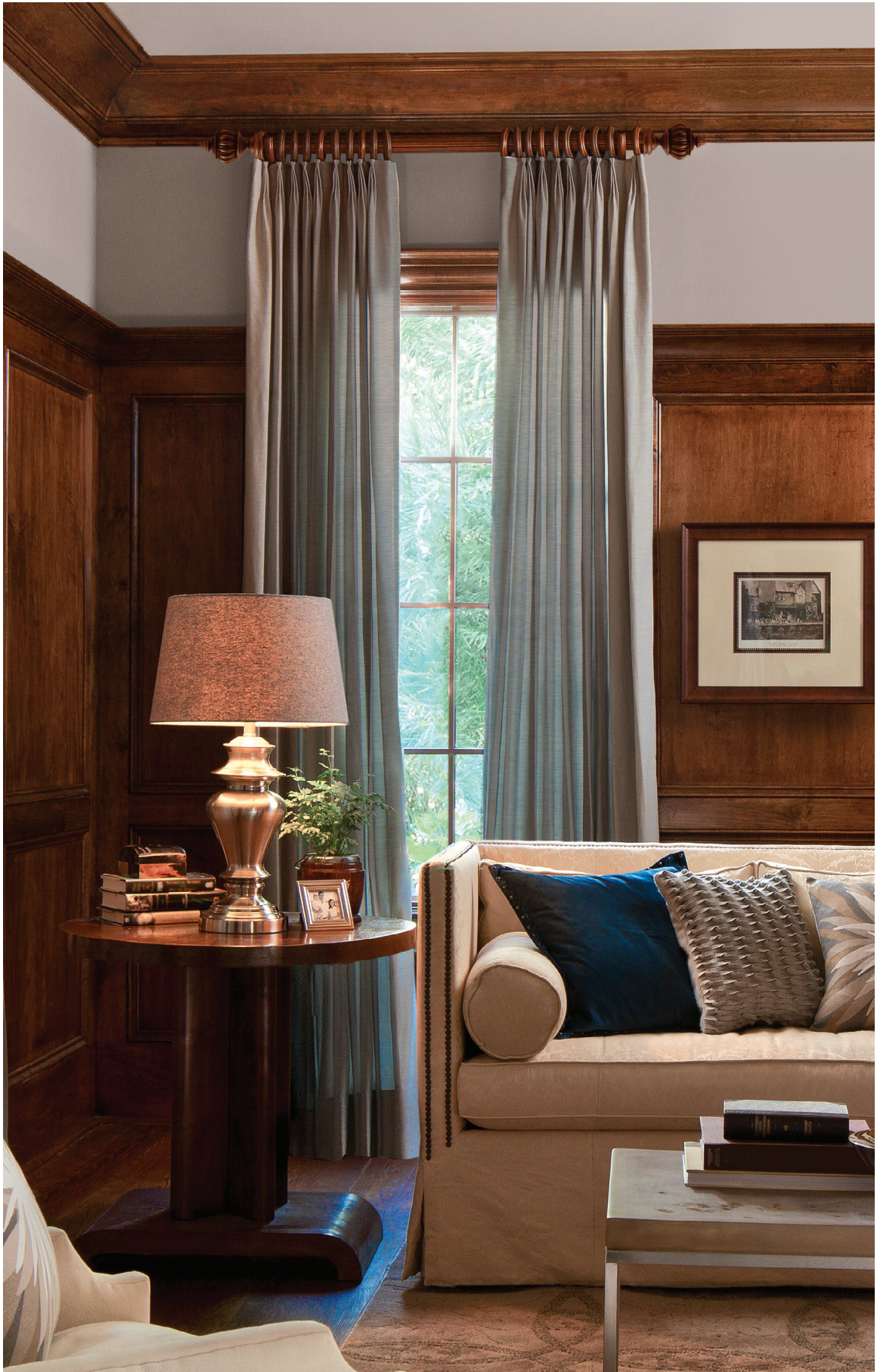
ARMADA Tortoise Shown