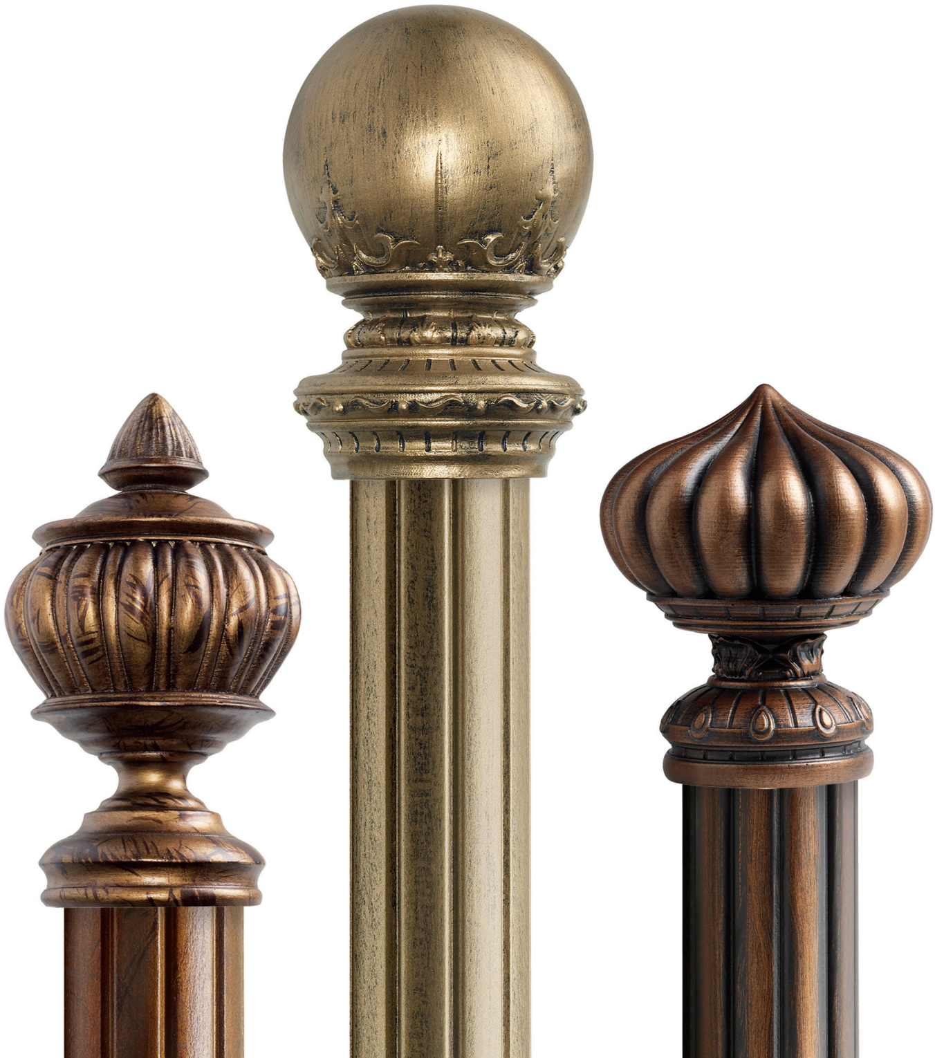
KENSINGTON Burnished Copper Shown. Size 2".