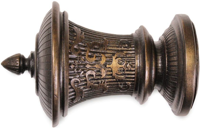
RENAISSANCE Bronze Shown. Size 2".