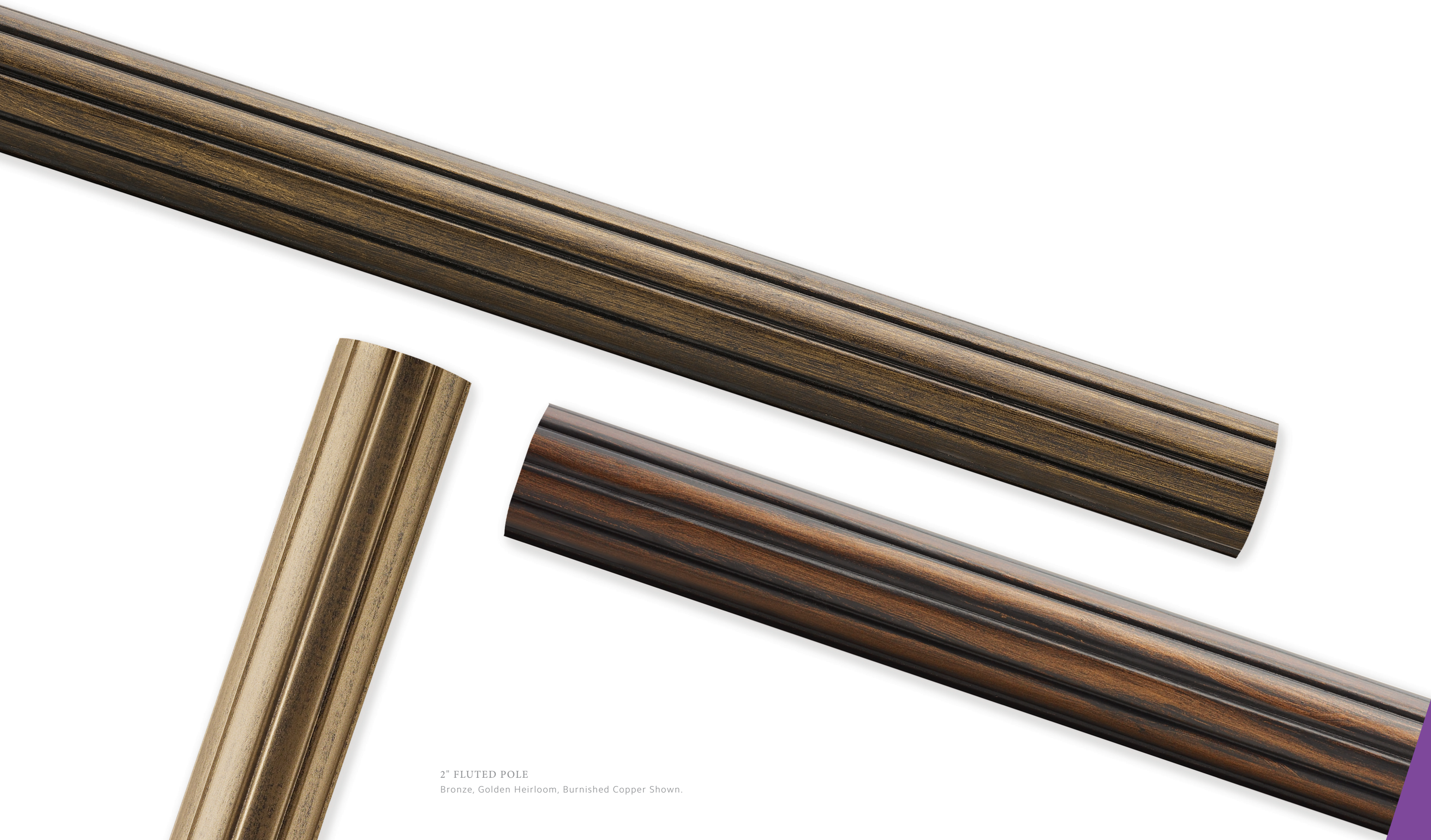
2" FLUTED POLE Bronze, Golden Heirloom, Burnished Copper Shown.