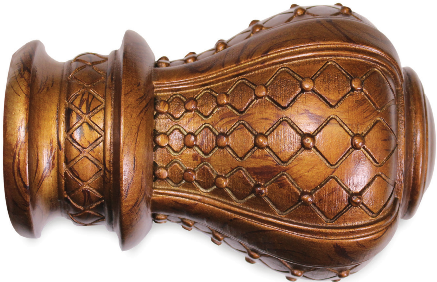
WESTMINSTER Tortoise Shown. Size 2".