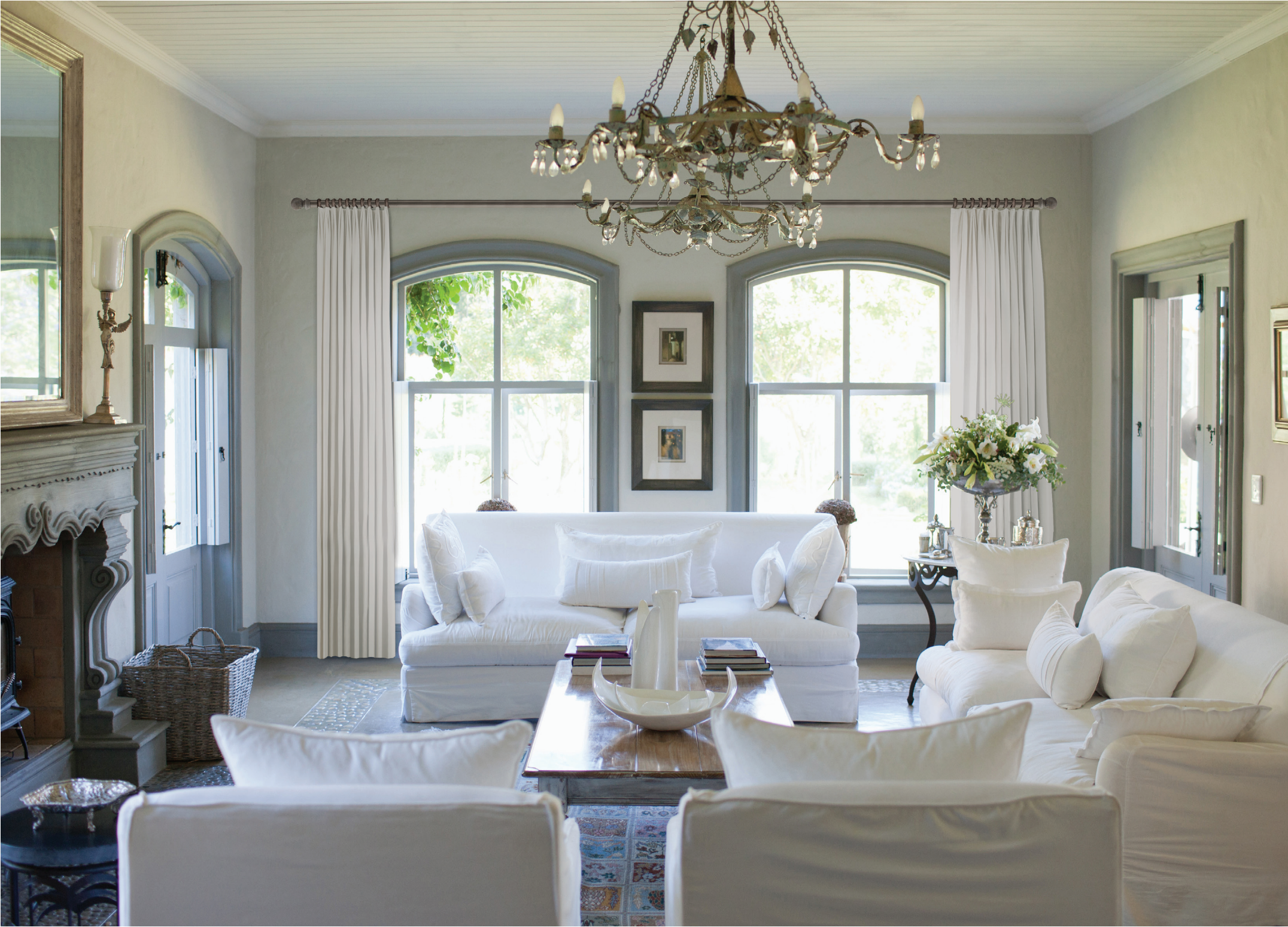
VICTORIAN Golden Heirloom Shown