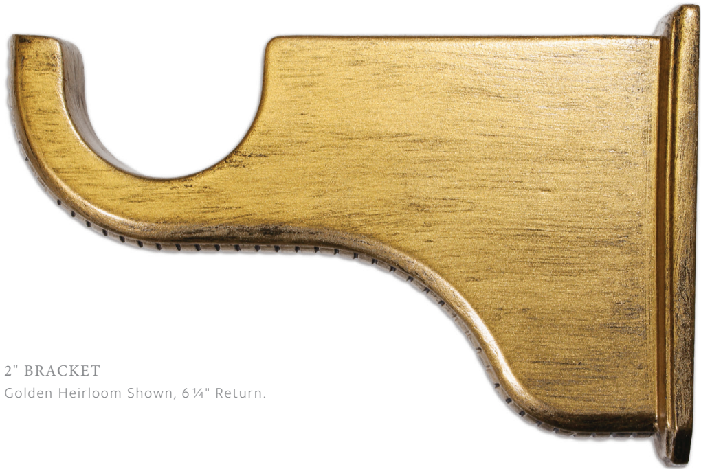
2" BRACKET Golden Heirloom Shown, 6 1/4" Return.