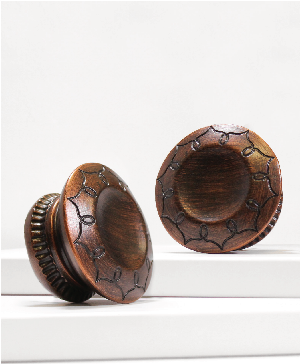
HASTINGS Burnished Copper Shown. Size 2".