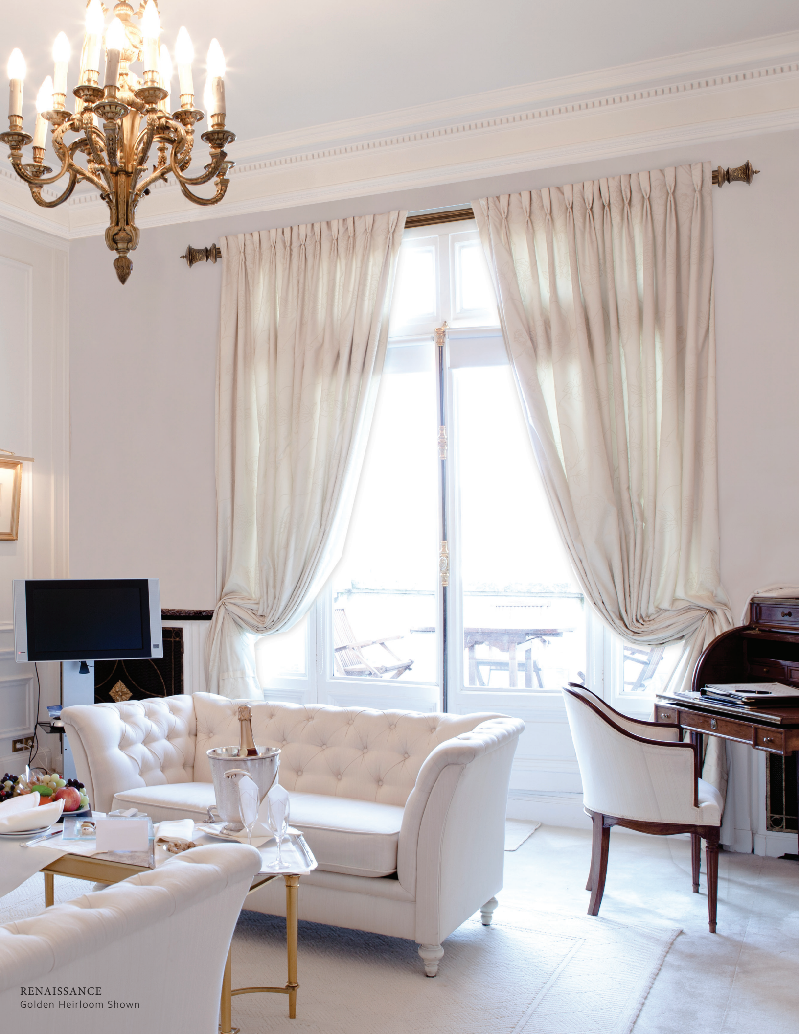
RENAISSANCE Golden Heirloom Shown