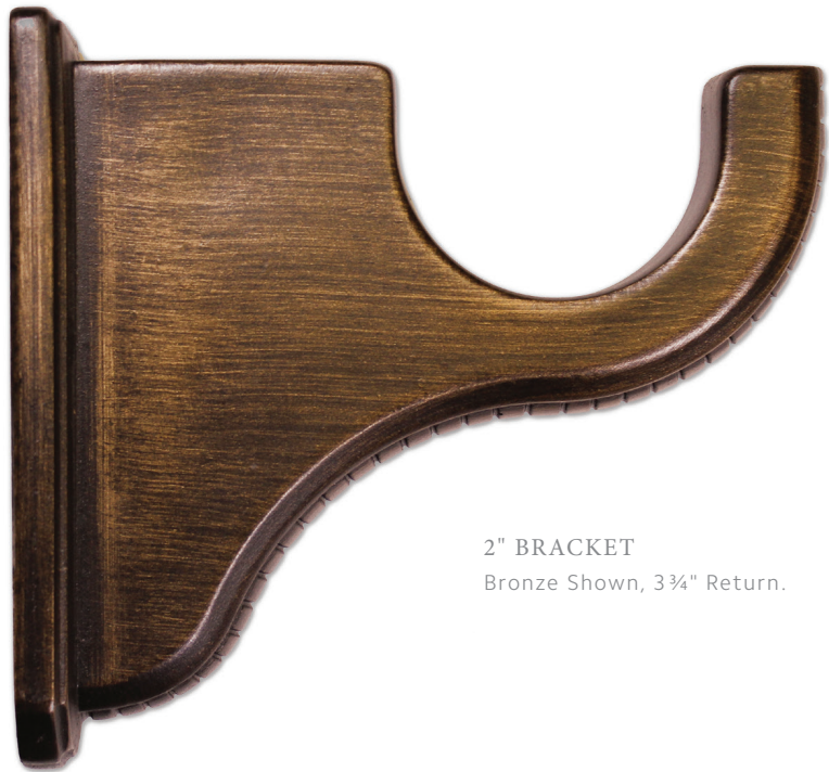
2" BRACKET Bronze Shown, 3 3/4" Return.