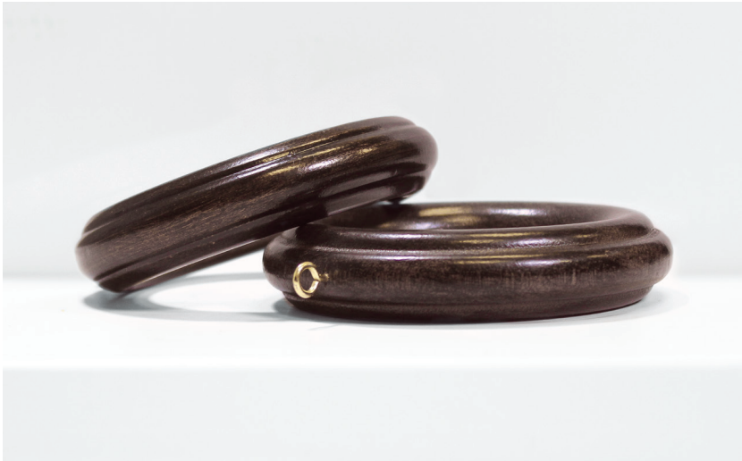
DECORATIVE RING Tortoise Shown. Size 2".