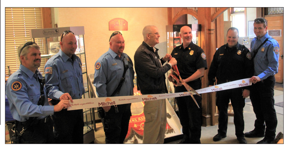
Dedication of Fireman's Banner 2019