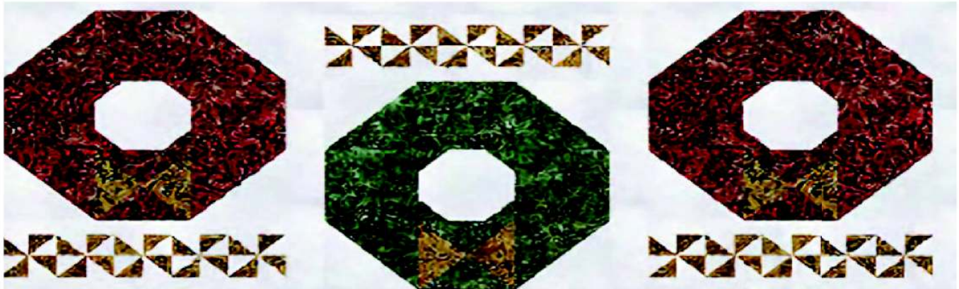
Lustrous Wreaths By Banyan Batiks Studio

LeTort Quilters of Carlisle www.letortquilters.com