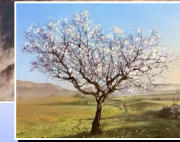
'Menorah Almond Tree'