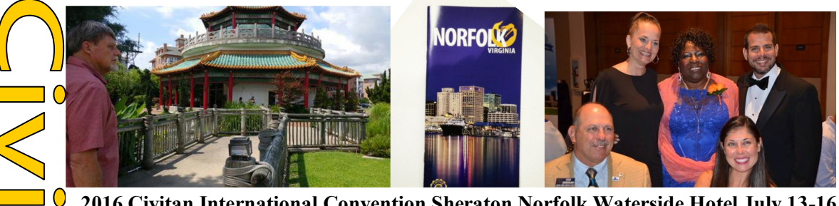
2016 Civitan International Convention Sheraton Norfolk Waterside Hotel July 13-16

Installation Banquet - Piedmont Club - Happy Hour 6:30