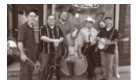
Comet Bluegrass All-stars