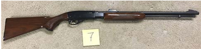
1 ea. Remington Model 572, .22S/L/LR, iron sights pump action. Condition good: Some surface rust that has been cleaned up and oiled. Little wear on stock.