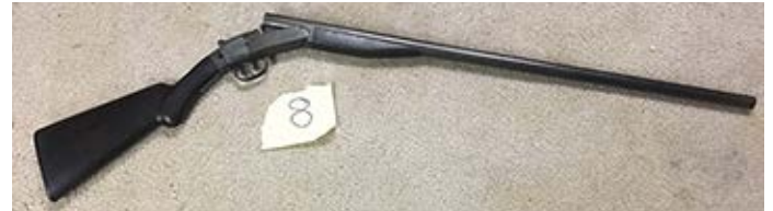
1 ea. Breakopen 12Ga shotgun, with no markings but a s/n 8554. Condition poor. Some surface rust that has been cleaned up and oiled. Would make a nice wall hanger.