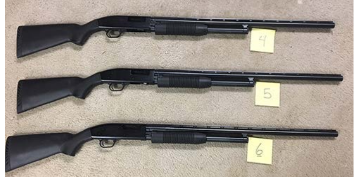
3 ea. Maverick Arms Model 88, 12Ga pump shotgun. Condition good to excellent. Low mileage and clean.