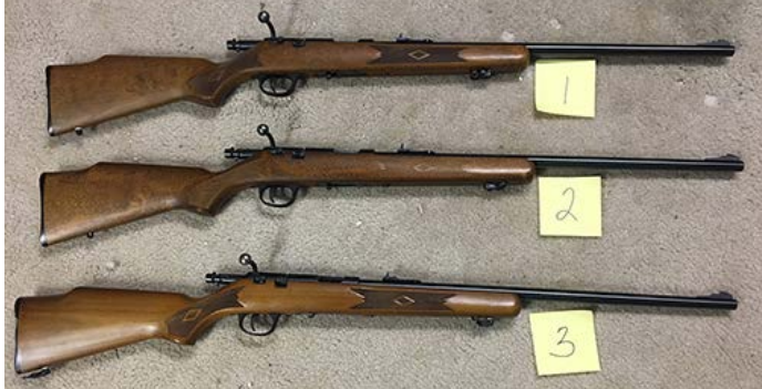
3 ea. Marlin Model 25N .22LR, iron sights. Condition good. Low mileage, but some surface rust that has been cleaned up and oiled. No pitting. Stocks clean. We only have 2 magazines for these. One rifle will be sold without a magazine.

The following long guns will be sold at live auction, at the February 20th open meeting: