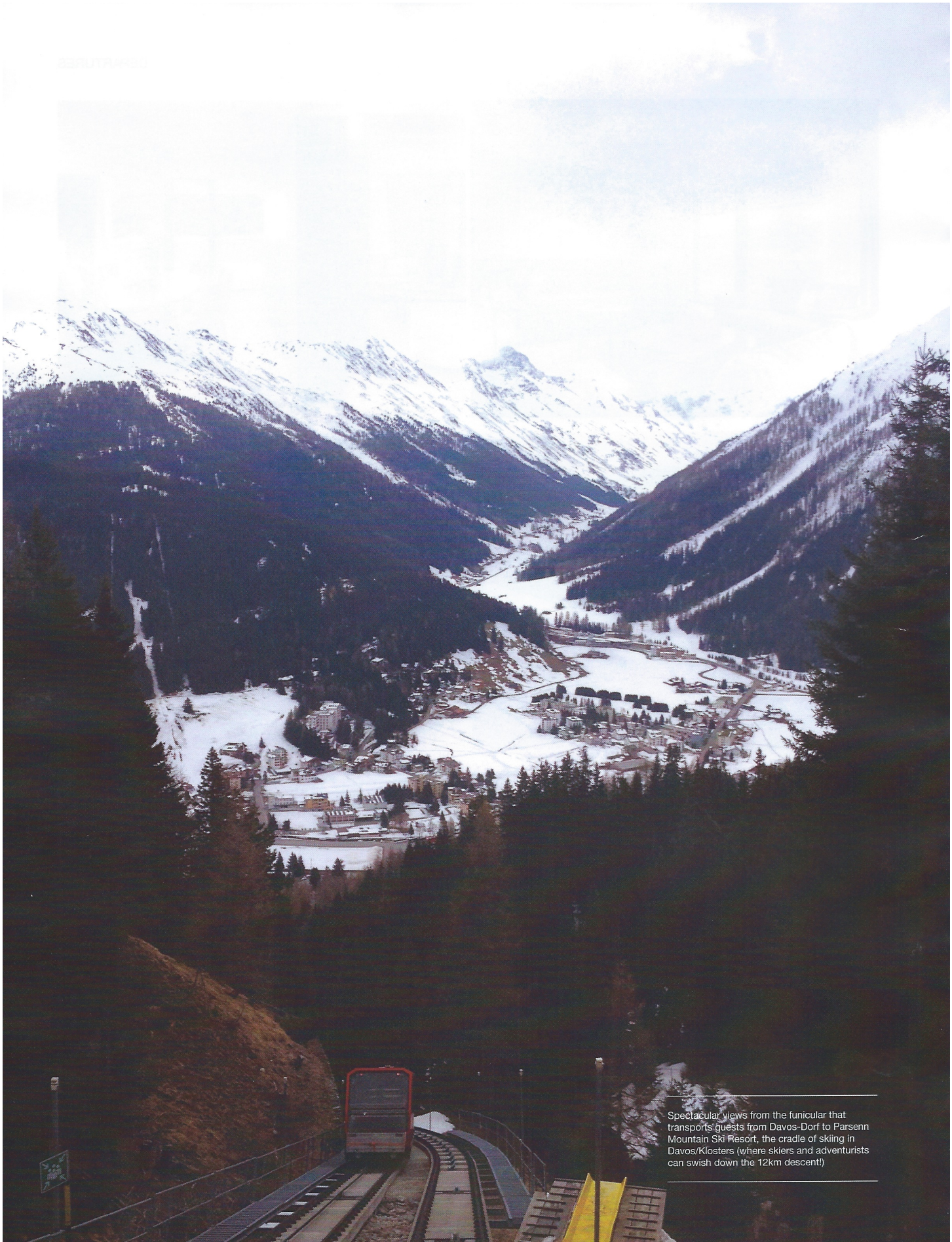
Spectacular views from the funicular that transports guests from Davos-Doif to Parsenn Mountain Ski Resort, the cradle of skiing in Davos/Klosters (where skiers and adventurists can swish down the 12km descent!)