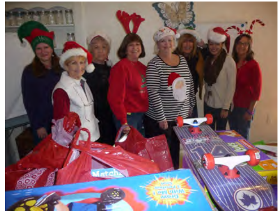
Newcomers elves posed with the gifts delivered to Safe House of Seminole County. Representatives from Safe House are also pictured.