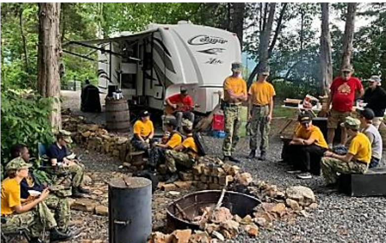
Campfire dinner is served.