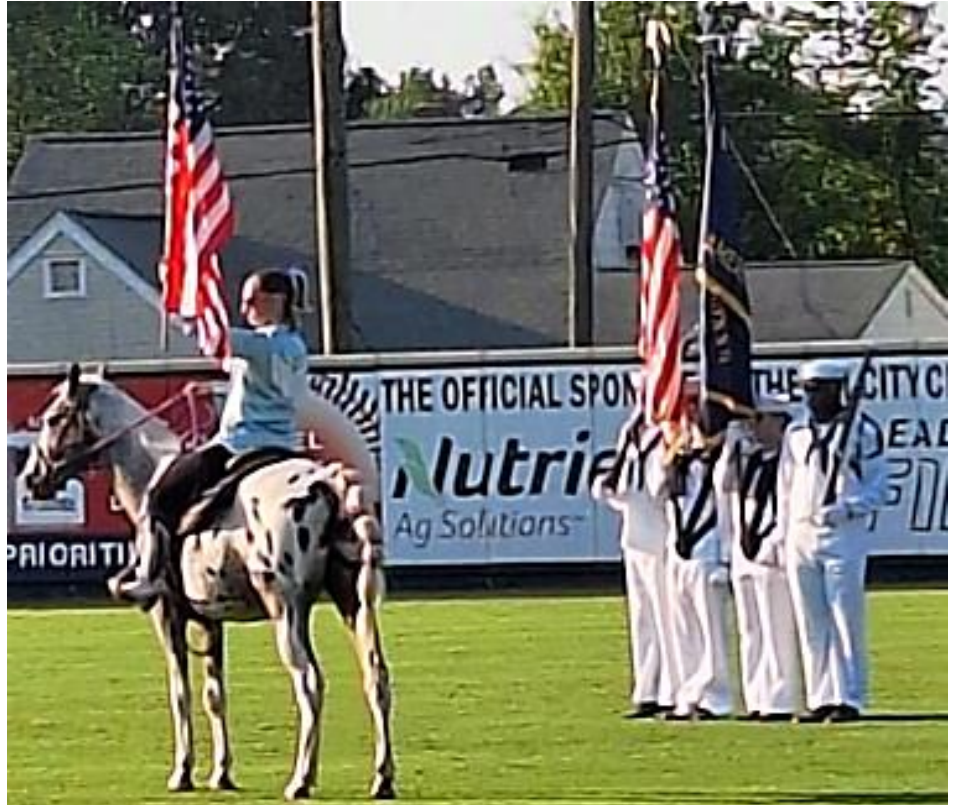
Rider joins the Color Guard in celebration of Flag Day

The Tri-City Chili Peppers is the hottest new team in the Coastal Plain League, located in Colonial Heights, VA.