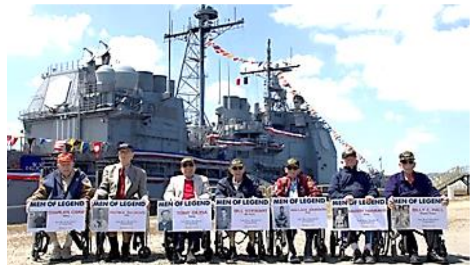
WWII Veterans visiting the ship for a picnic on the pier.