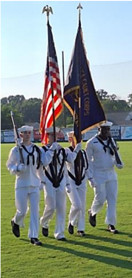
Sea Cadets Color Guard for the Coastal Plain League Baseball game at Shepherd Stadium, Colonial Heights on June 14 th , 2024.