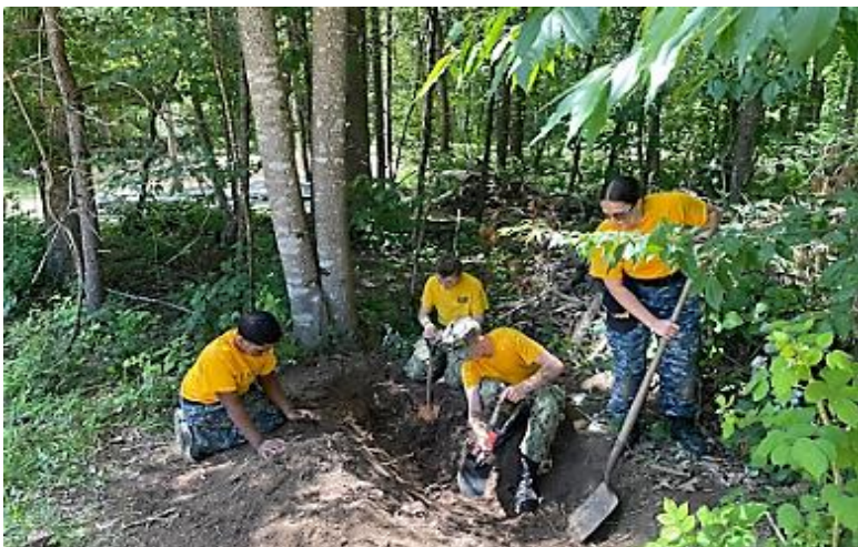
Working together as a team digging a fox hole.