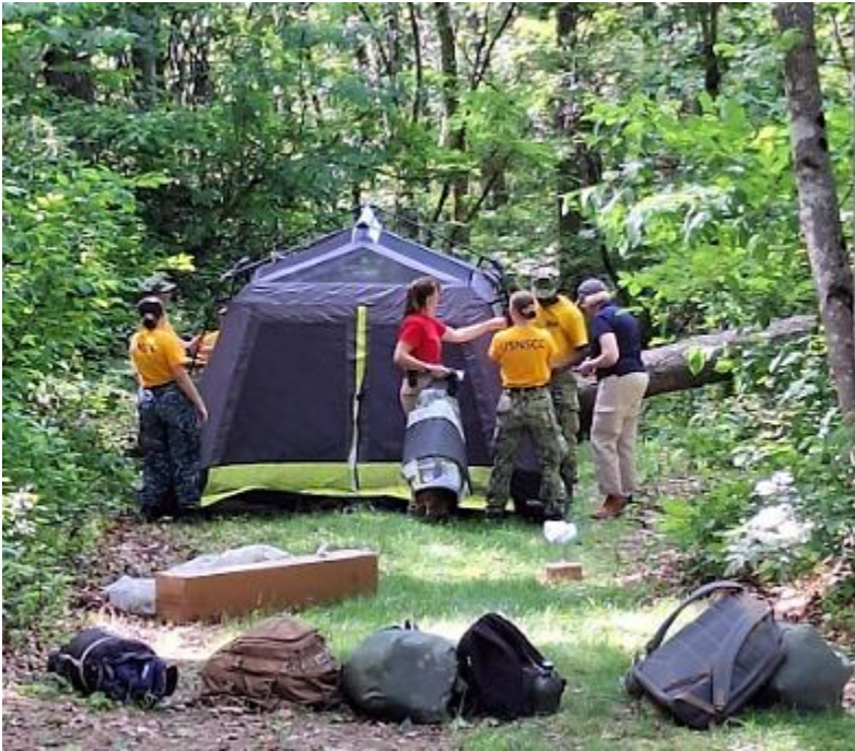
Cadets preparing their lodging for the weekend.