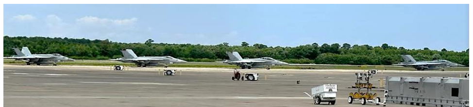
F/A-18F Super Hornets taxi down the runway.