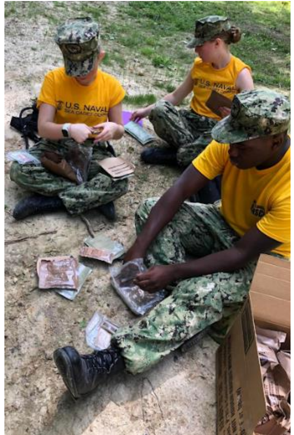
Only the finest MRE's (meals ready to eat) for the cadets.