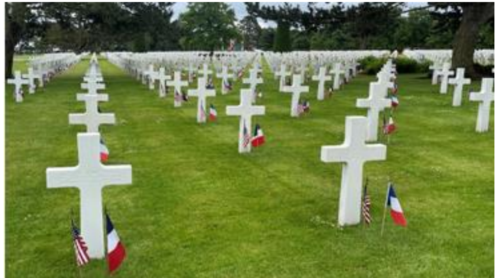
A photo from a Sailor's visit to the American National Cemetery at Omaha Beach.