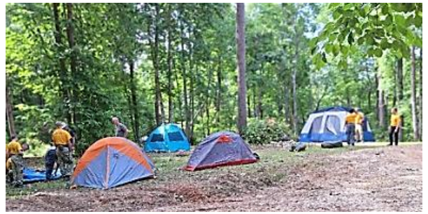
About 14 cadets and six staff members set up camp.