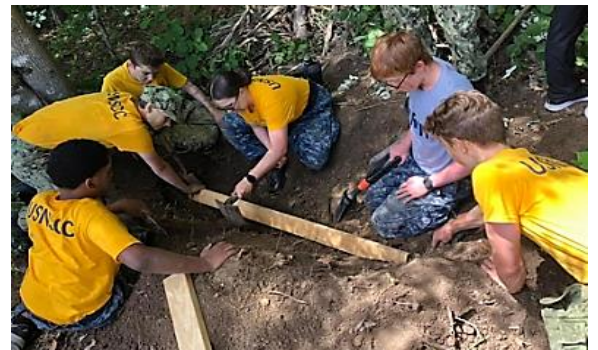
Cadets working together to dig a fox hole.