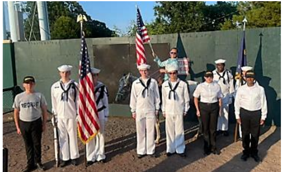
AMERICA Division Sea Cadets attending the event.