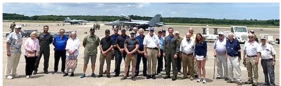
The tour officially ended as our group watched the Squadron of eight VFA-213 Super Hornets take off.