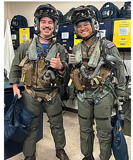
Two pilots all geared up and ready to fly.