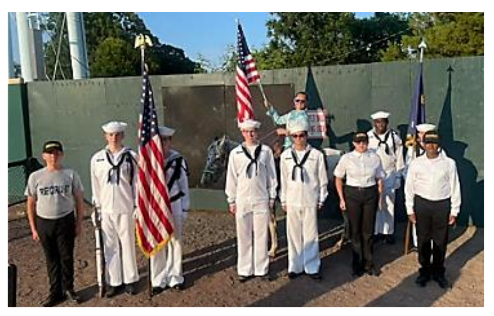
AMERICA Division Sea Cadets attending the event.