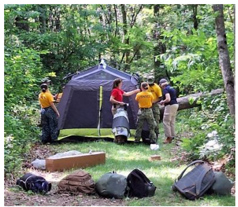
Cadets preparing their lodging for the weekend.