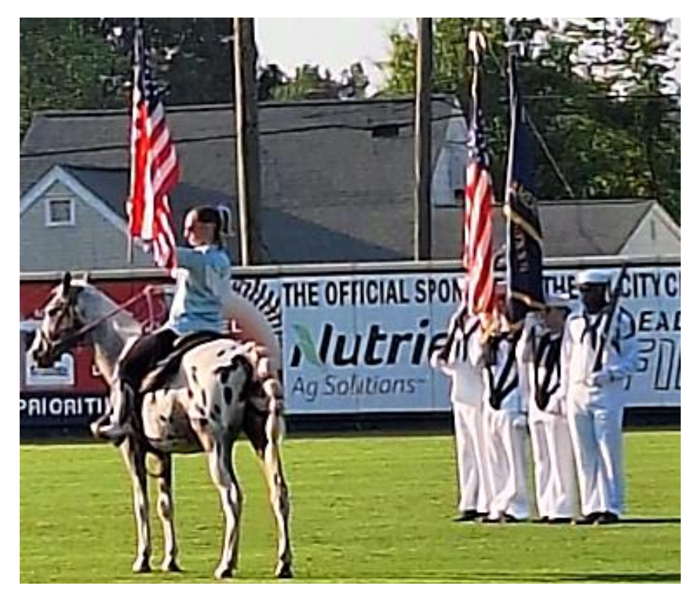
Rider joins the Color Guard in celebration of Flag Day