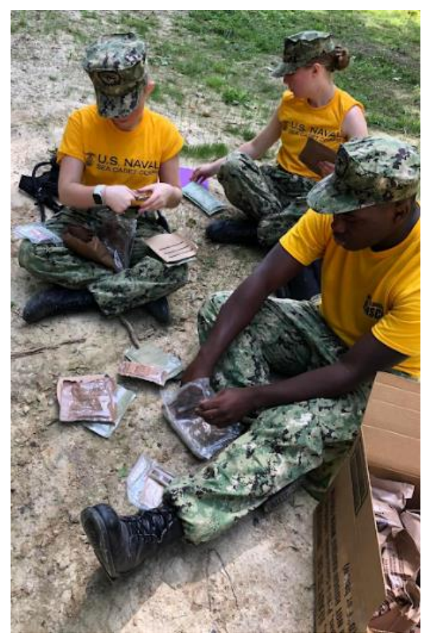
Only the finest MRE's (meals ready to eat) for the cadets.