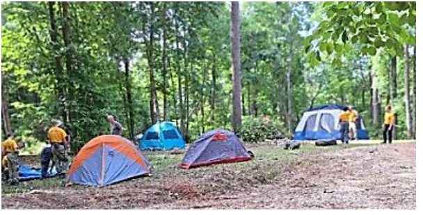
About 14 cadets and six staff members set up camp.