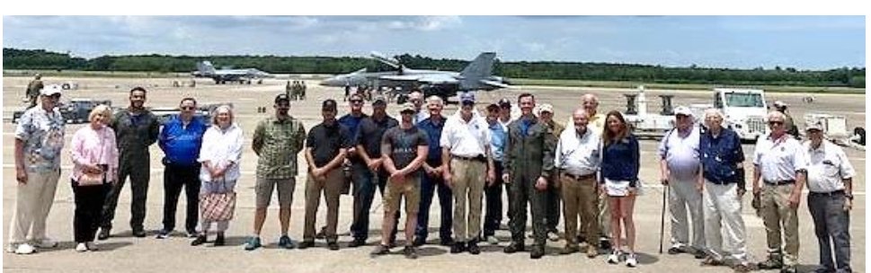
The tour officially ended as our group watched the Squadron of eight VFA-213 Super Hornets take off.