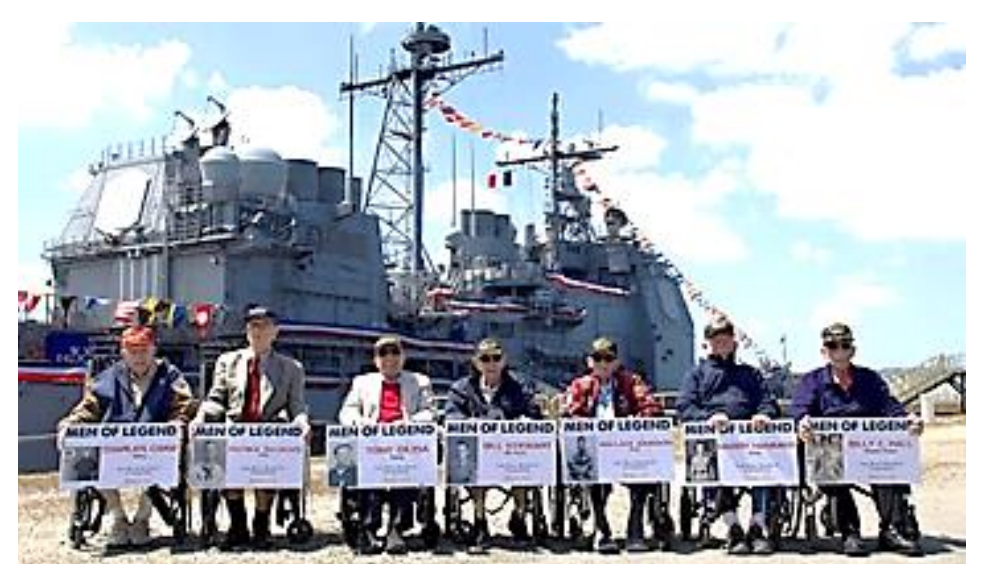
WWII Veterans visiting the ship for a picnic on the pier.