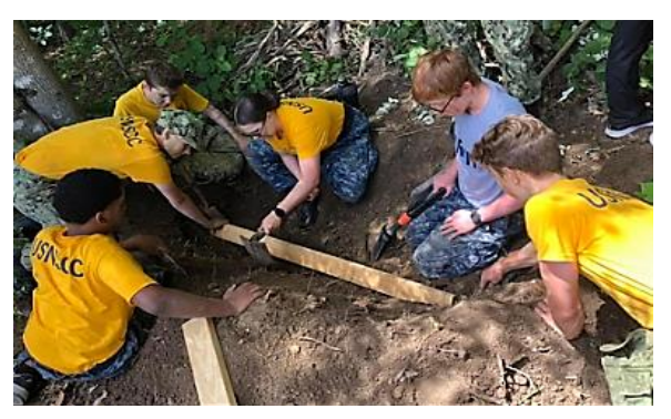
Cadets working together to dig a fox hole.