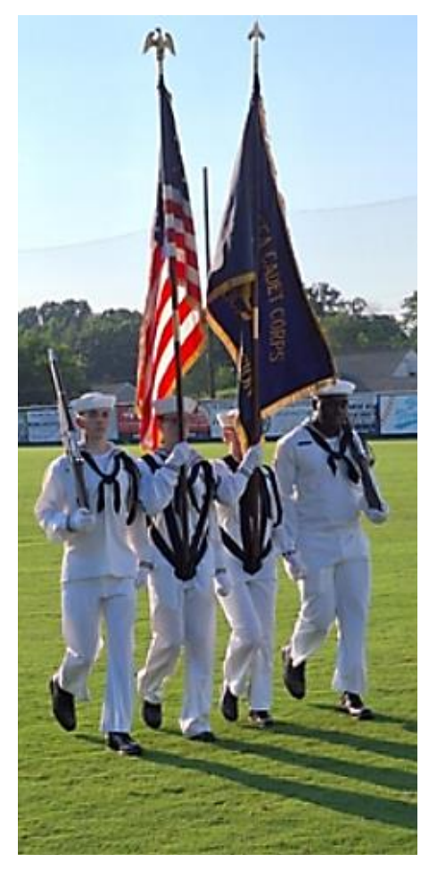
Sea Cadets Color Guard for the Coastal Plain League Baseball game at Shepherd Stadium, Colonial Heights on June 14<sup>th</sup>, 2024.

The Tri-City Chili Peppers is the hottest new team in the Coastal Plain League, located in Colonial Heights, VA. (Source: Facebook)