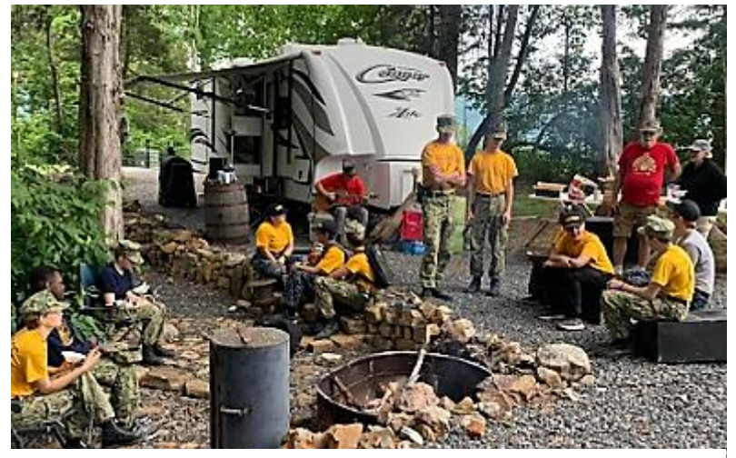
Campfire dinner is served.