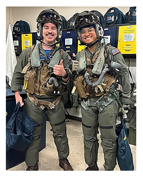
Two pilots all geared up and ready to fly.