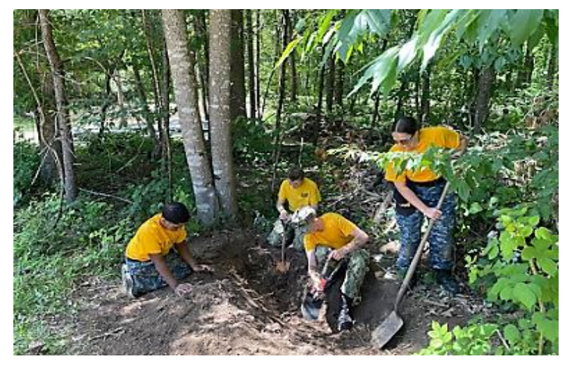
Working together as a team digging a fox hole.