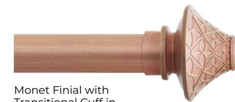
Monet Finial with Transitional Cuff in Blush finish