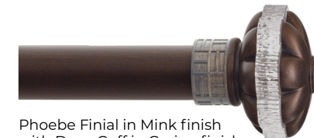
Phoebe Finial in Mink finish with Deco Cuff in Greige finish