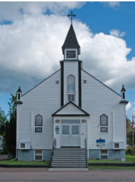
Our Lady of Mercy 11 St. Andrews Street Pointe-du-Chêne, NB