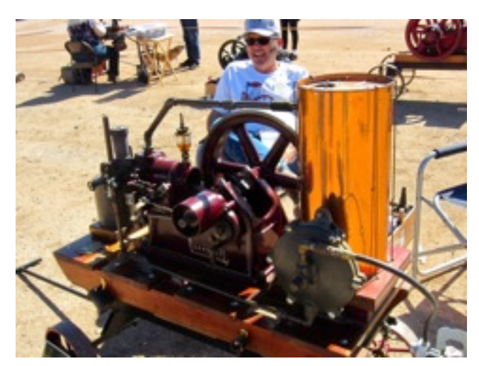
Bill & Gardener Engine