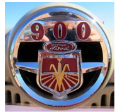
Neat hood ornament