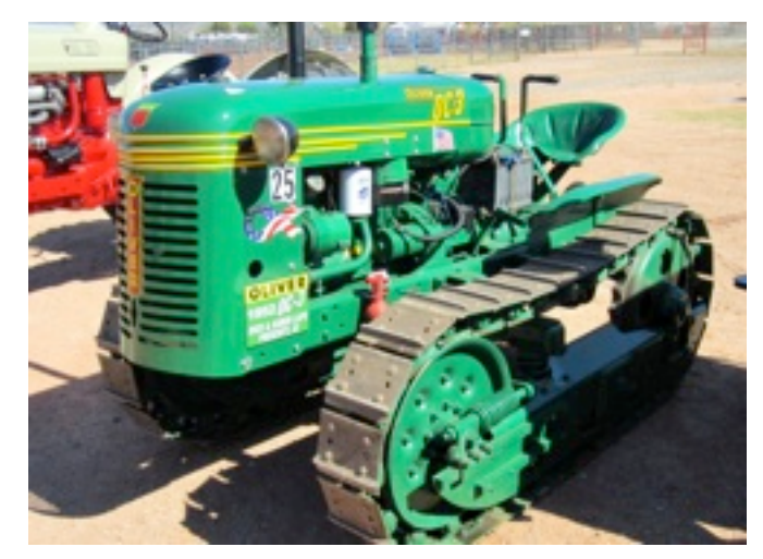
Oliver OC 3