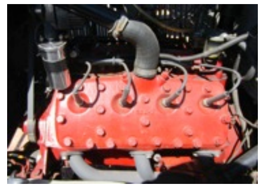
Ford flathead engine