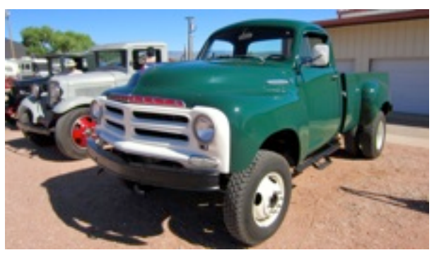
Studabaker 4WD pickup