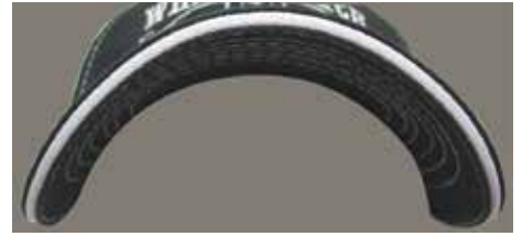
Woven Sandwich (Used to add a Flag, Text, or Custom Color)