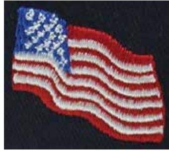
American Flag (Straight or Wavy)