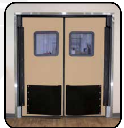
Shown in Beige w/ 24" bumpers