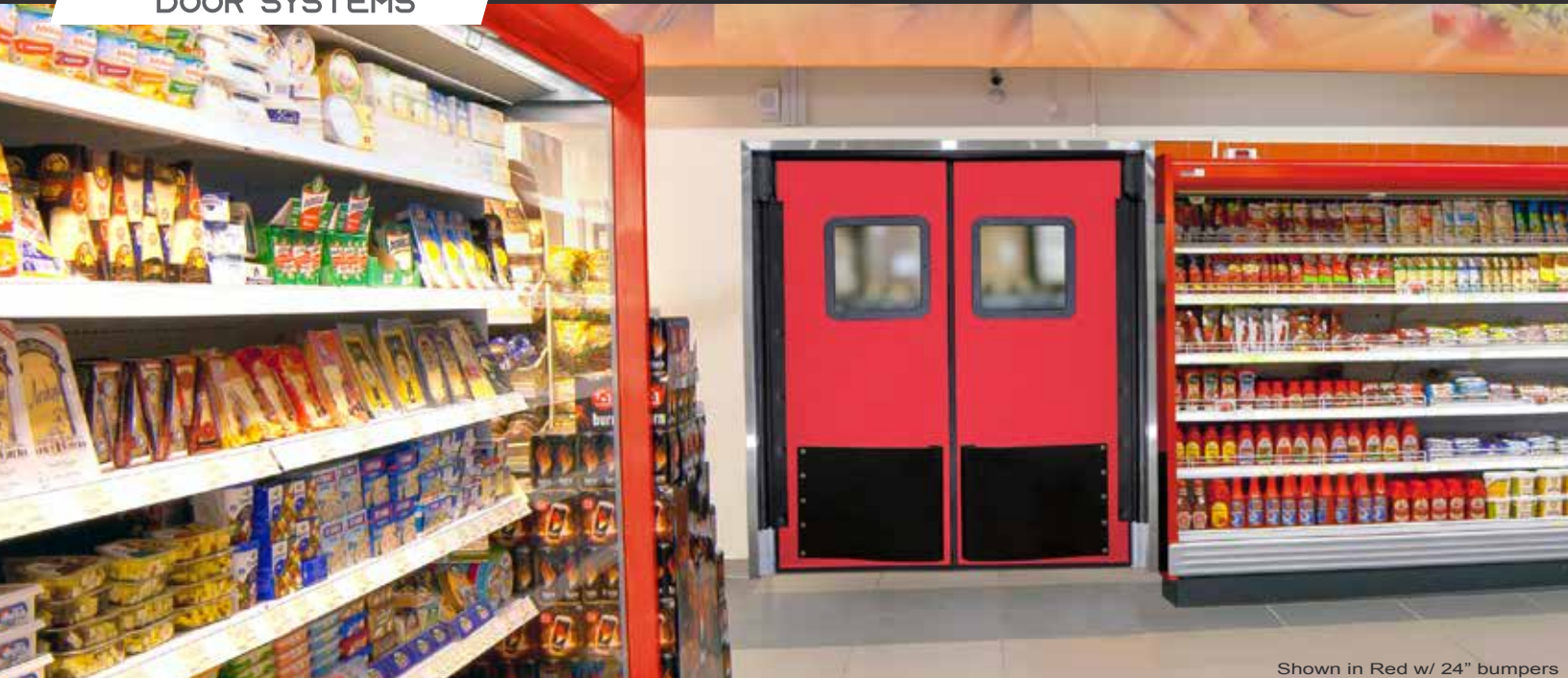
Shown in Red w/ 24" bumpers

The Phoenix RD Durable Insulated impact door is designed and manufactured with a composite internal structure and ABS surface, providing incomparable long-term performance in many demanding environments.