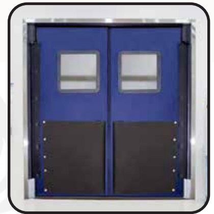
Shown in Canyon Blue w/ 36" bumpers