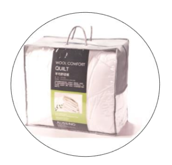
Non-Woven + PVC Bag Option