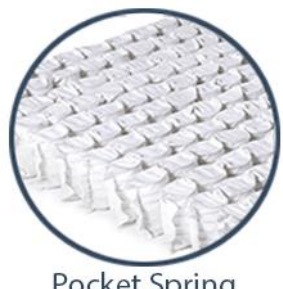
Pocket Spring (option)