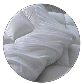
Elastic skirt Option