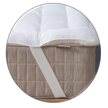
Elastic Band Option

Fire Retardant Treatment or Waterproof Treatment