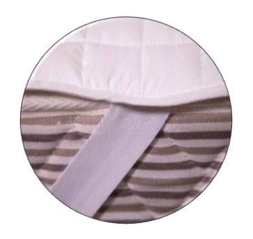
Elastic Band Option