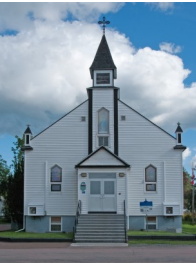
Our Lady of Mercy 11 St. Andrews Street Pointe-du-Chêne, NB