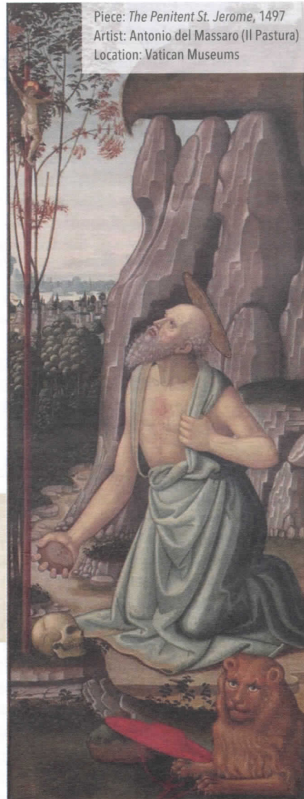
Piece: The Penitent St. Jerome , 1497 Artist: Antonio del Massaro (Il Pastura) Location: Vatican Museums

How can I accept all the good God gives me, and desire his will above my own?