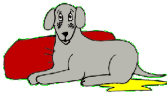
Illustration by Wendy Brooks, DVM

When a house pet develops urinary incontinence, many owners fear the worst. Assumptions that incontinence signifies senility or irreparable age related change may lead to delay in medical consultation, relegation of the pet to an outdoor life, or even euthanasia. In reality, urinary incontinence is usually one of easiest problems to solve so it is crucial that veterinary assistance be sought before an owner's patience is completely worn out and before any permanent decisions about the pet's future become topical.