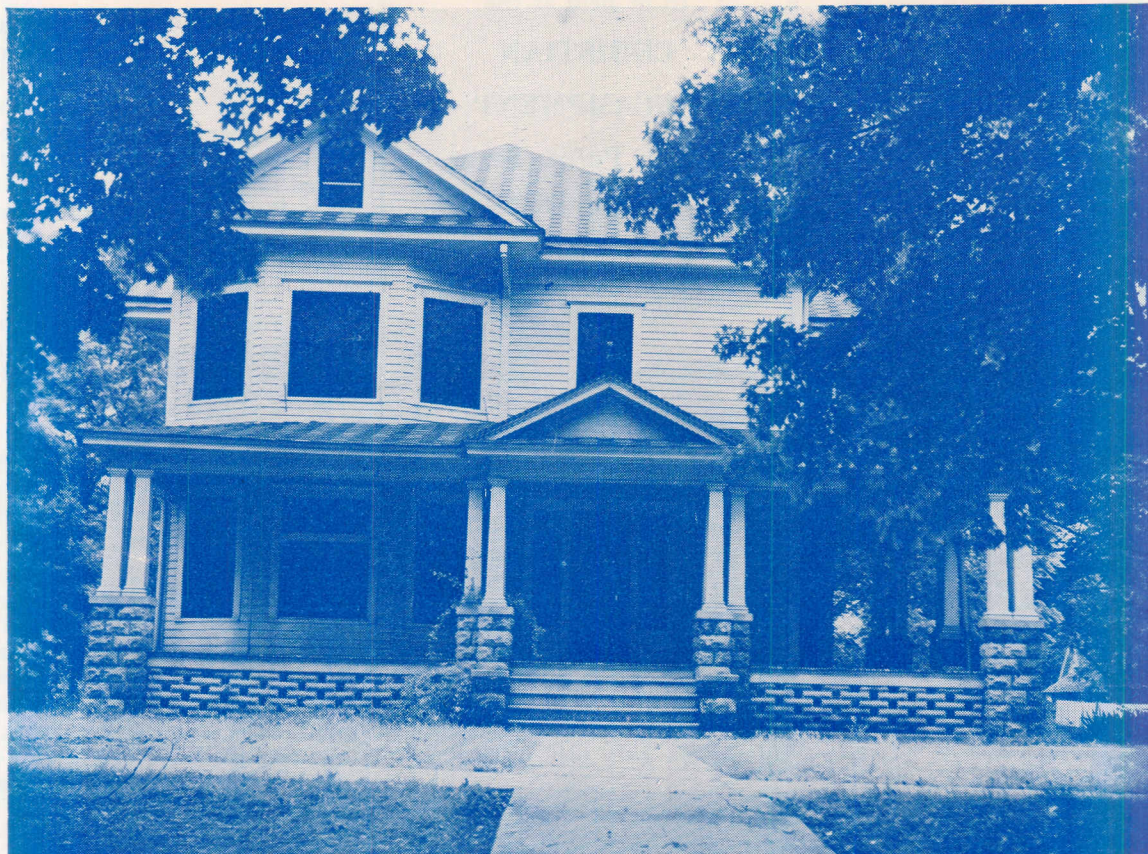
This is a picture of the building recently purchased for a Bible School.

We the Board of Trustees for the Apostolic Faith Bible School of Baxter Springs, Kansas, wish to express our appreciation to the entire Movement for their splendid cooperation in the securing of a Bible School building for the Movement.