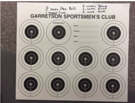
Garretson Club 10 Bull Target