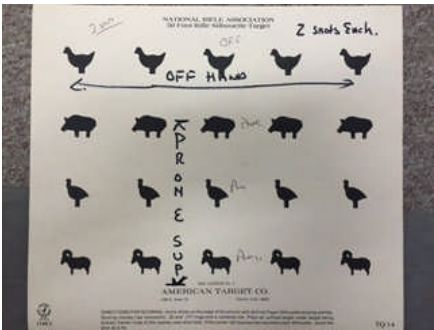
NRA TQ-14 Target