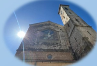
Church of the Visitation