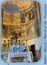
Upper Church, Church of the Visitation

At the top of each hour, communal prayer reflecting on the Jewish roots of Mary Benediction ~ approximately 2:45 pm Confessions ~ TBA during adoration hours