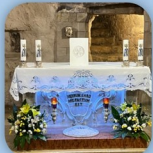
Church of the Annunciation