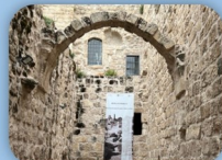
Home of Mary, Martha, & Lazarus