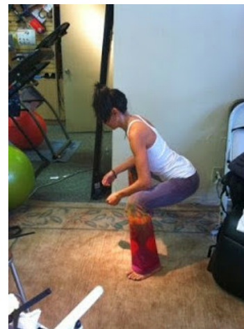
Correct way to pick up things from the floor (After)

So my back pain has gone away. Now if I could only do something about my hip pain! ;)