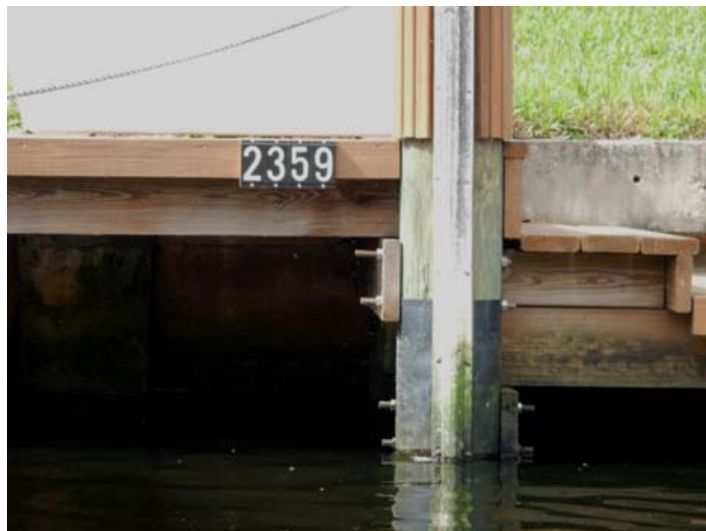
Street numbers displayed on the dock

For a cost of under $10 for the four numbers, and 15 minutes of time, it's easy to comply with this ordinance.