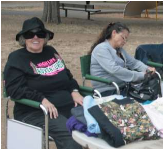
The Lucky winner gets to Pick a Jacket