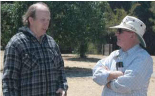
Chatting, Relaxing Enjoying