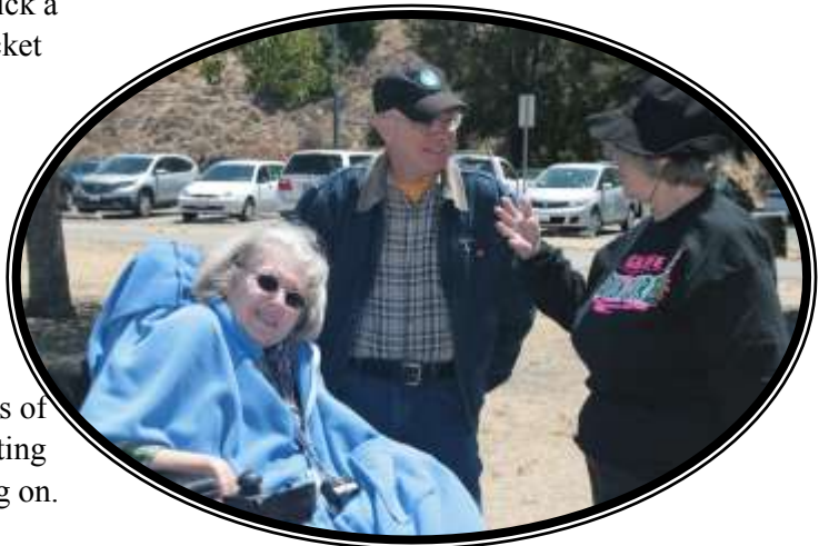
Lets of visiting going on.