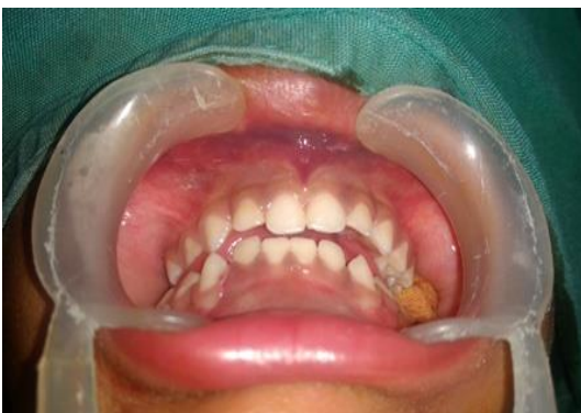
FIG 1 PRE-OPERATIVE CLINICAL PICTURE DEPICTING LINGUAL DISPLACEMENT OF FRACTURED FRAGMENT