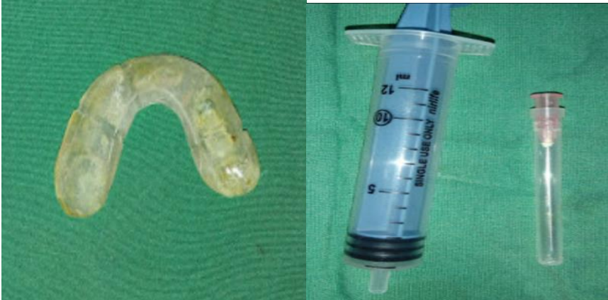
FIG 3 CUSTOMIZED CLOSED OCCLUSAL SPLINT AND 18 GAUGE NEEDLE HUB