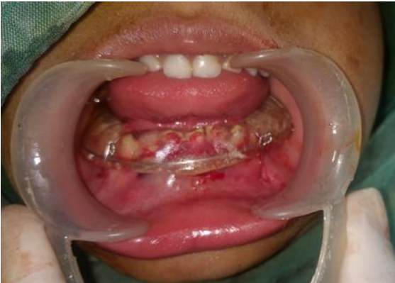
FIG 5 SPLINT SECURED IN PLACE AFTER WIRING