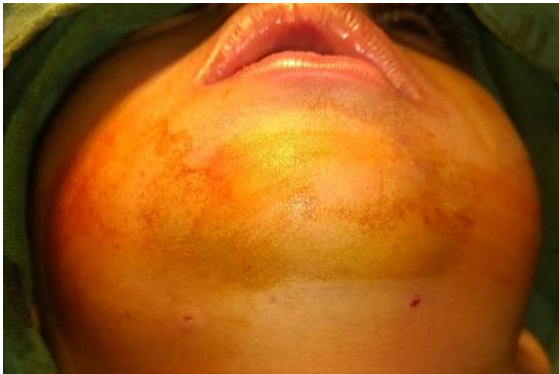
FIG 6: PERCUTANEOUS ENTRY SITES OF THE NEEDLE HUB