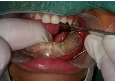
FIG 4 PERCUTANEOUS ENTRY OF NEEDLE HUB WITH THE WIRE IN THE LINGUAL VESTIBULE