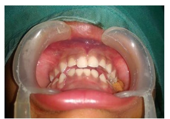
FIG 1 PRE-OPERATIVE CLINICAL PICTURE DEPICTING LINGUAL DISPLACEMENT OF FRACTURED FRAGMENT