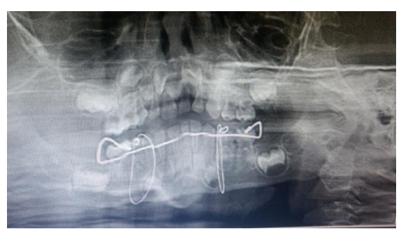
FIG 7: POST OP OPG