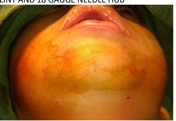
FIG 6: PERCUTANEOUS ENTRY SITES OF THE NEEDLE HUB