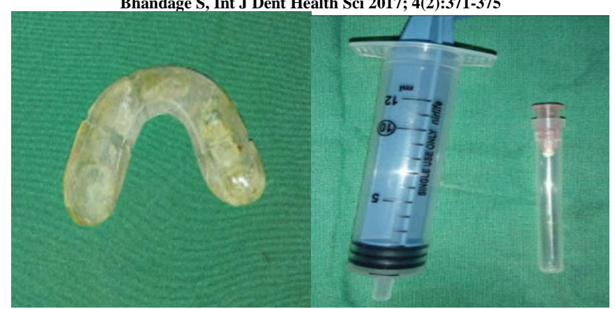
FIG 3 CUSTOMIZED CLOSED OCCLUSAL SPLINT AND 18 GAUGE NEEDLE HUB

Bhandage S, Int J Dent Health Sci 2017; 4(2):371-375