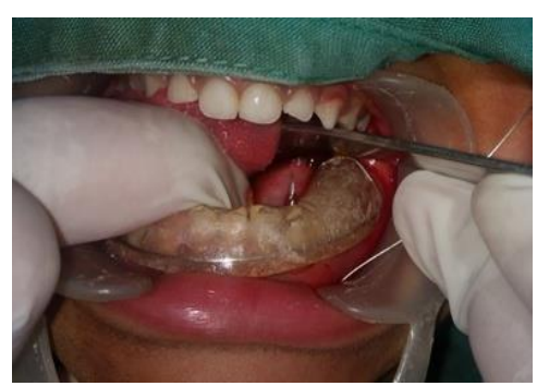
FIG 4 PERCUTANEOUS ENTRY OF NEEDLE HUB WITH THE WIRE IN THE LINGUAL VESTIBULE